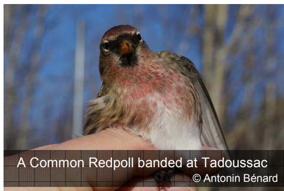
A Common Redpoll banded at Tadoussac

of members of the Fringillidae. The most impressive movements occurred on the 22 nd and 23 rd of October, when 22,000 Common Redpolls flew south-west over Tadoussac. On the 23 rd of October, during the 8 th hour of observations alone, an amazing 4,647 individuals were counted, which is equivalent to 77 birds per minute!